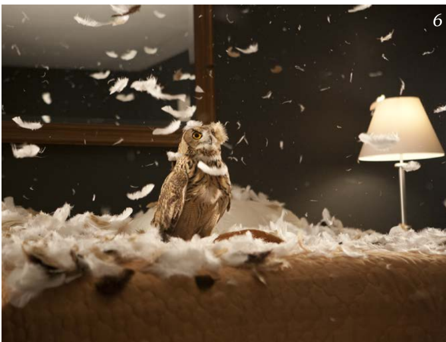
DOUG AITKEN, MIGRATION (EMPIRE) (STILL), 2008