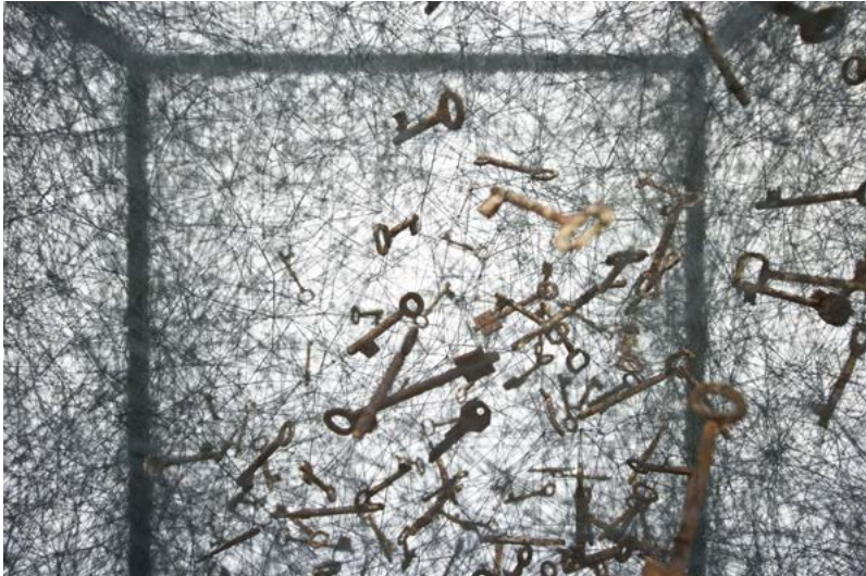
CHIHARU SHIOTA, UNCERTAIN JOURNEY, 2016, STATE OF BEING (KEYS), COURTESY THE ARTIST AND BLAIN|SOUTHERN