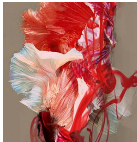
ZAC LEE, FIGHTING FISH, OIL ON JUTE 2016