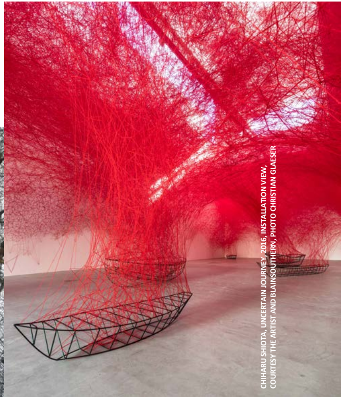
CHIHARU SHIOTA, UNCERTAIN JOURNEY, 2016, INSTALLATION VIEW